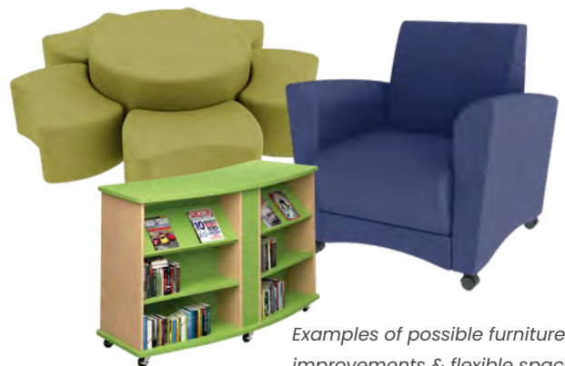
Examples of possible furniture improvements & flexible spaces